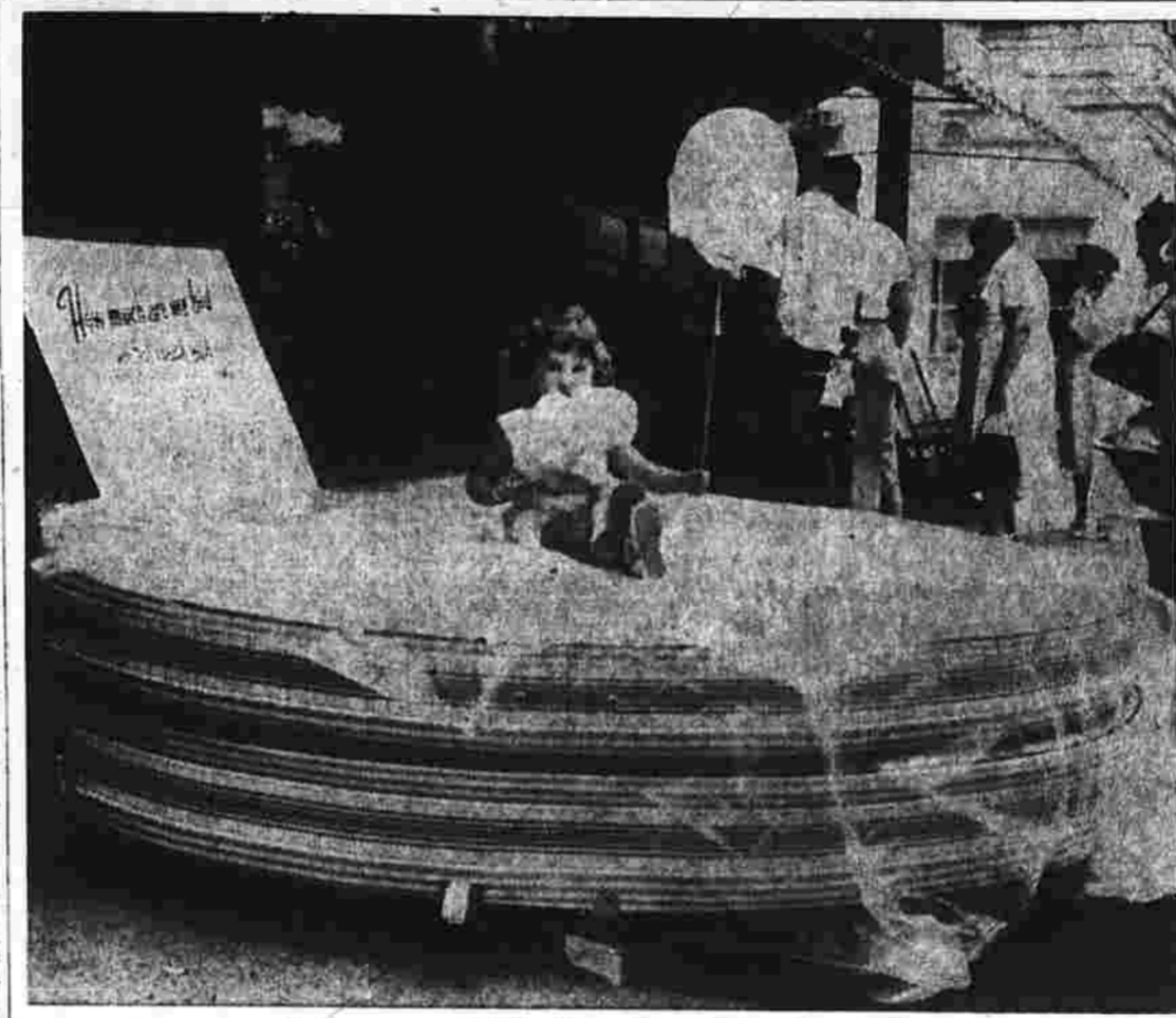
Sugar and Spice Not Up for Bids We're afraid even the highest bidder for the round bed outside Watkins Bros. Furniture Store today won't be awarded this 2-year-old bundle of sugar and spice who took advantage of the resting place to eat her cotton candy.

Paris, July 13 (AP)—President Charles de Gaulle said last night the West will never let the Soviet Union settle the fate of Berlin alone.