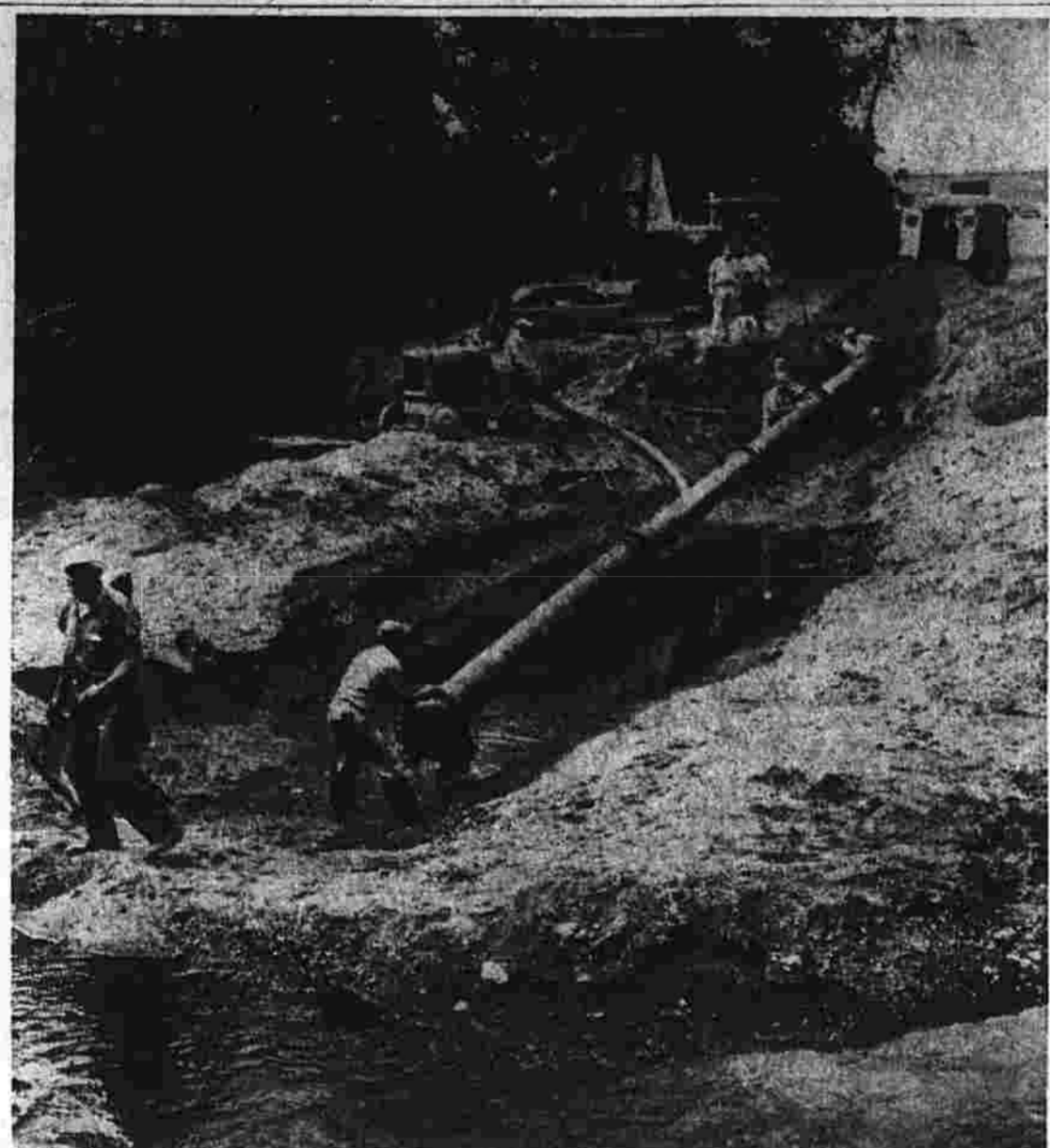
Water Main Laid Under River

The pipe connected the storm drain installed by the federal government contractor within the housing project itself, and the storm drain installed in W. Center